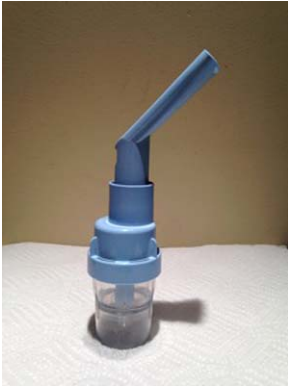
Respironic Sidestream nebulizer

Keeping your nebulizer cups cleaned daily will ensure you are getting the full benefit of your treatment as well as cutting down on bacterial growth on your equipment. Please see below on acceptable ways to clean your nebulizer cups. Your local equipment vendor can make monthly deliveries of neb cups, if not every other month. If you haven't been receiving regular deliveries of these nebulizer cups, please contact Emily Dischino, nurse coordinator, and she will happily get you set up with these deliveries.