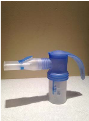
Pari LC Sprint nebulizer