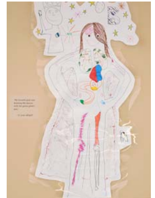
Artwork on display in front of the Children's Specialty Center